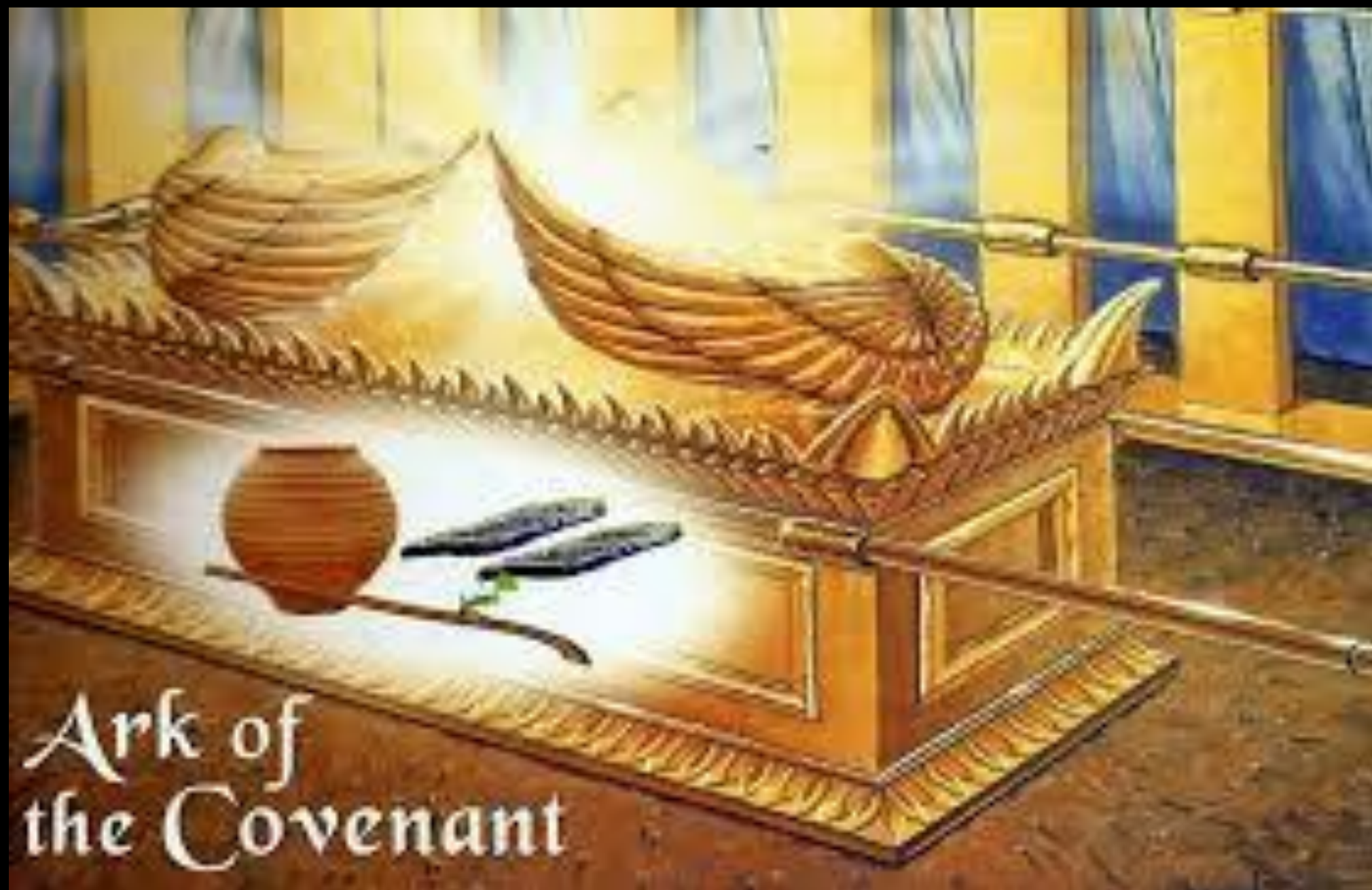
Ark of the Covenant